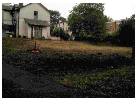
Current view of the front garden